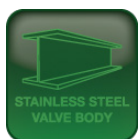
Stainless Steel Valve Body