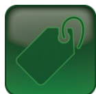
Stainless Steel Tags