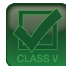
Class V Leakage Test