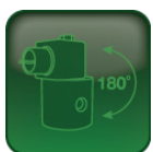
Universal Mount *1/2" and 3/4" only