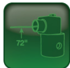
72" Lead Length