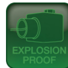
ETL Certified - Explosion Proof